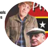
Phoney Fools and Horses