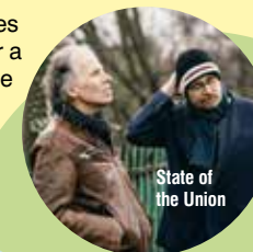
State of the Union