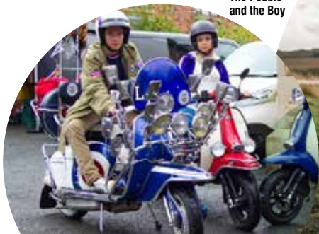
The Pebble and the Boy