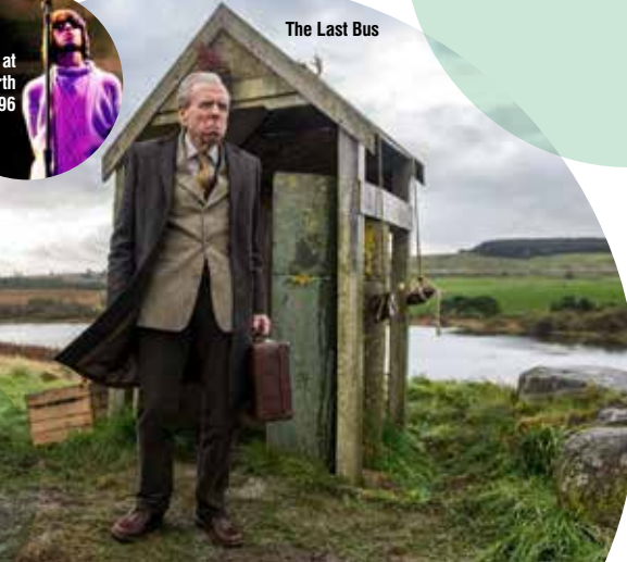
The Last Bus