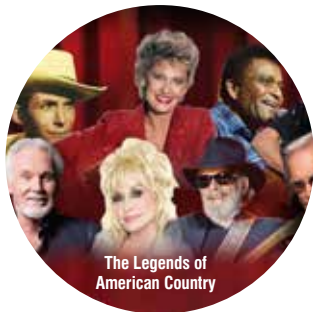
The Legends of American Country