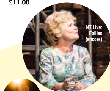
NT Live: Follies (encore)