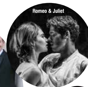
Romeo & Juliet