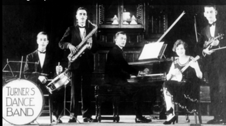
Regular performers here in the 1930s