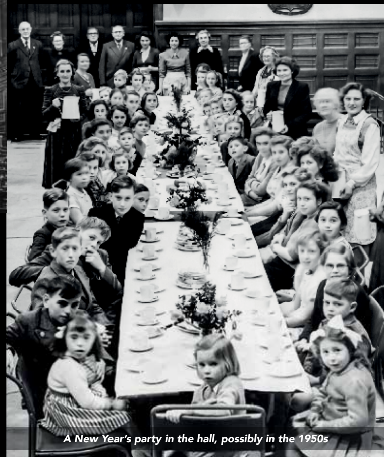
A New Year's party in the hall, possibly in the 1950s