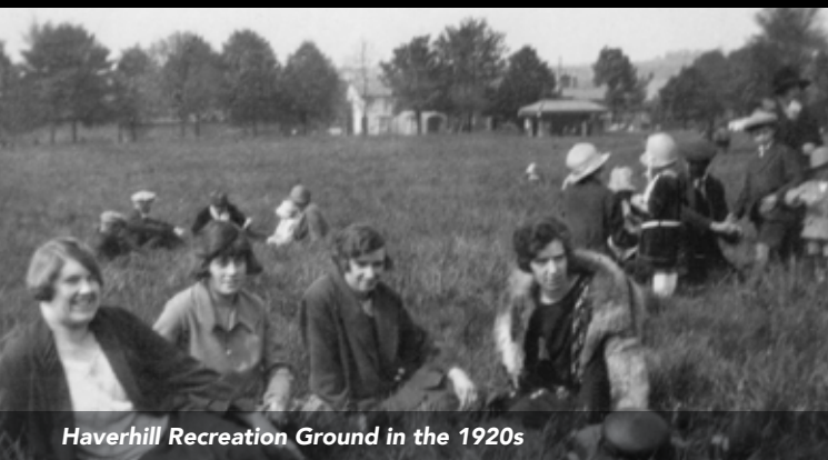
Haverhill Recreation Ground in the 1920s

If you are pushed for time call us on 01440 714936 and we will have your lunch ready for when you arrive.