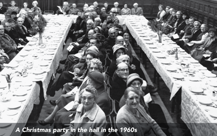
A Christmas party in the hall in the 1960s