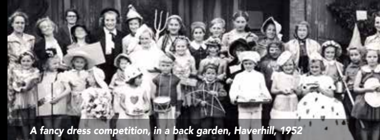
A fancy dress competition, in a back garden, Haverhill, 1952