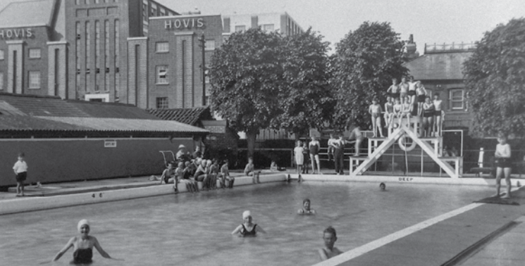
Haverhill open air pool with the Hovis Mill, possibly in the 1950s