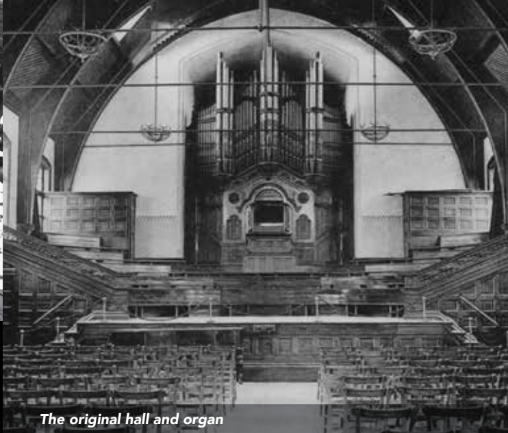
The original hall and organ